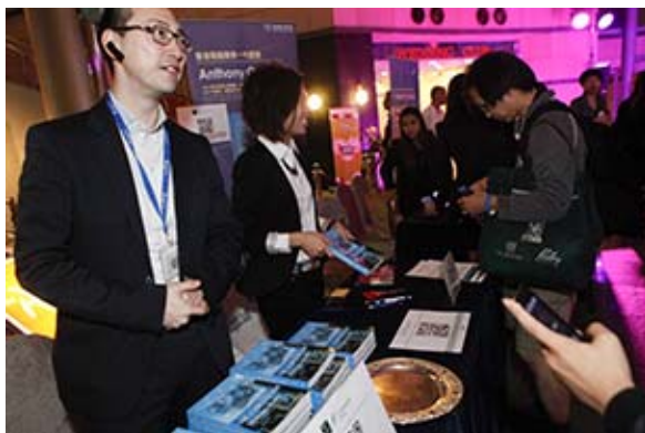
TABLE TOP PLACEMENT

Having a table top placement at the entrance of a selected conference room of your choice provides attendees with a copy of your company brochure when they enter the room; serves as excellent reading material while waiting for programs to start.