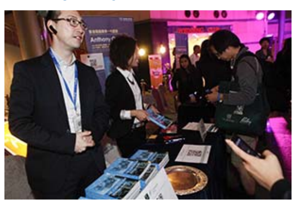
TABLE TOP PLACEMENT

Having a table top placement at the entrance of a selected conference room of your choice provides attendees with a copy of your company brochure when they enter the room; serves as excellent reading material while waiting for programs to start.